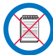
Book, notes, sketches or paper