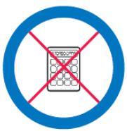
Calculator – except in specified subjects