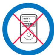
Electronic device such as MP3 player, iPod, tablet or smartwatch